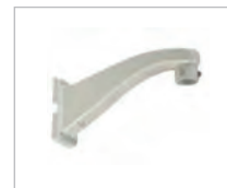
NWB-300 Wall Mount Bracket