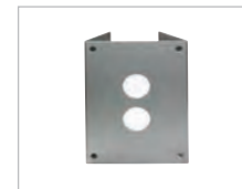
PMA-100 Pole Mount Adapter