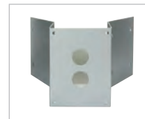
CMA-100 Corner Mount Adapter