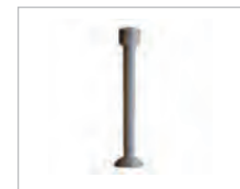
NWB-301 Ceiling Mount Bracket